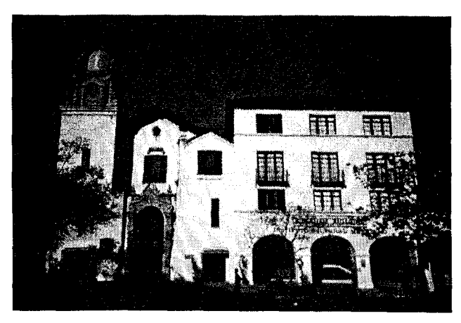
Fig. 2. The art deco Bisquiluz Building (to the right of the church) was transformed by cultural commodification inio the Mexican revival style of adjacent Olvera Street.

Parenthetically, the Pobladores, the original group of settlers, included only 2 pure-blooded Spanish. The remainder of the 44 were mestizos and mulatos , Indios and Negros .<sup>5</sup>