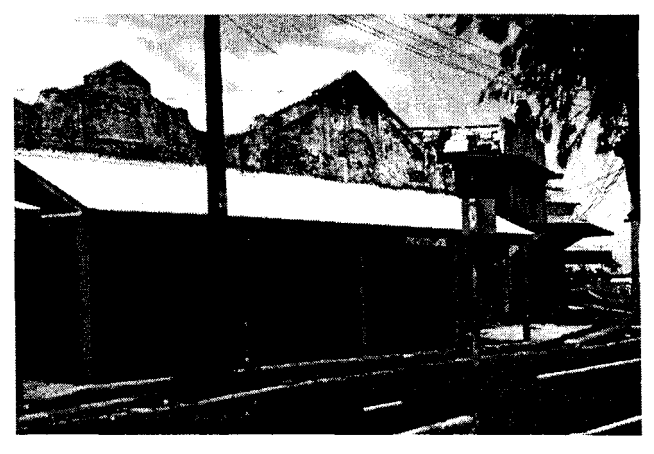
Fig. 4. Typical Beach Street businesses, c. 1890s, of Levuka, Fiji.

The resources we were looking at in Levuka dated from the turn of the century, and included the oldest (and still operating) hotel, public school, Masonic lodge and private club in the South Pacific. While we visited several traditional villages, and looked at bure construction and patterns of use, we were not invited to Fiji to preserve those resources. Rather, we were invited to work on resources which were built by westerners 'like us.' Among the design exercises were urban design charrettes for four sites in the town. The most interesting of these was the shop houses along Beach Street. Fijian towns are traditionally inhabited by descendants of the Indian immigrants, who are the merchant class today, while villages are occupied by Fijians (indigenous Melanesians). In Levuka, the shopkeepers live behind their stores in buildings which are officially designated historic structures. Because the town is full, and the surrounding land is Fijian village land,