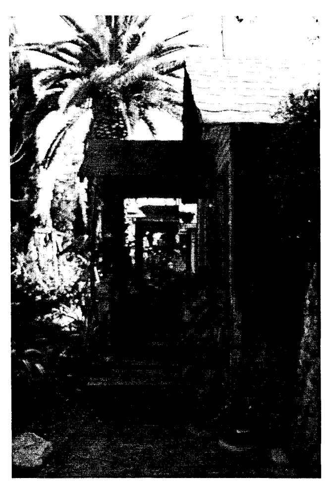
Fig. 3. The simple cottages of St. Elmo Village, tranformed by the artist residents and students into a singular cultural institution.

engine was sugar cane, and today is tourism. Their indigenous populations were overtaken in numbers and power by immigrants from other countries brought in to work the plantations. In the case of Fiji, however, the Melanesians initiated a series of coups in the 1980s which greatly reduced the power and the population of the former guest workers, Indians from the subcontinent.